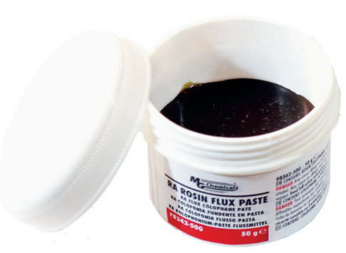
#8342-50G (50 g)

A RA Rosin Flux Paste superior electronic grade flux paste system that makes SMD electrical and electronics soldering faster and easier. It is designed for lead-free alloys, but it works well with conventional leaded solder. It is easy to apply and stays on the area where it is applied, and a little bit goes a long way. It does not contain any Zinc Chloride or Ammonium Chloride. Post soldering residues removal is much easier due to the organic acid base of the flux.