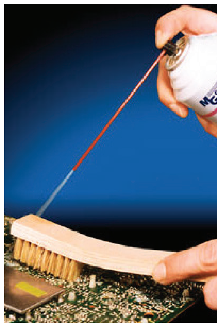
Dissolving the Flux

Removing flux is a two-step process that involves dissolving the flux and rinsing off the dissolved flux. The rinsing step is very important because after dissolving the flux it may appear that the solids in the flux have disappeared. But once the flux remover has evaporated away, the solids will re-deposit on the board as a white residue.